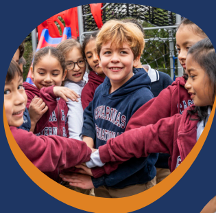
Team building games

Live afternoons full of learning, games, and new experiences