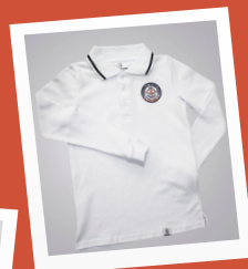
Long-sleeve polo shirt