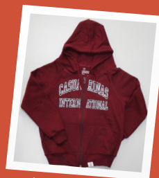
CIC Maroon Jacket