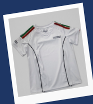
P.E. Dry-Fit T-shirt